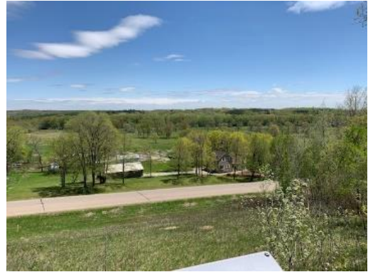
From the Overlook

Just a few miles south of St. Joe is a treasure that abounds in natural wonders. Several interesting hiking trails are at your boot tips. You can opt for a trail that meanders past a small stream and